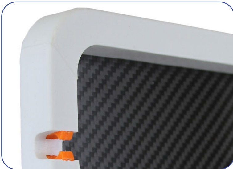
Curved Corners and Cable Management