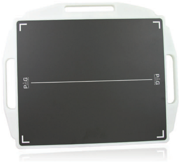
HD Dual Handle Protect-A-Grid Encasement 51.4x45x2.54cm (20.25x17.75x1in.) 1 kg (2.25lb. (w/out grid))