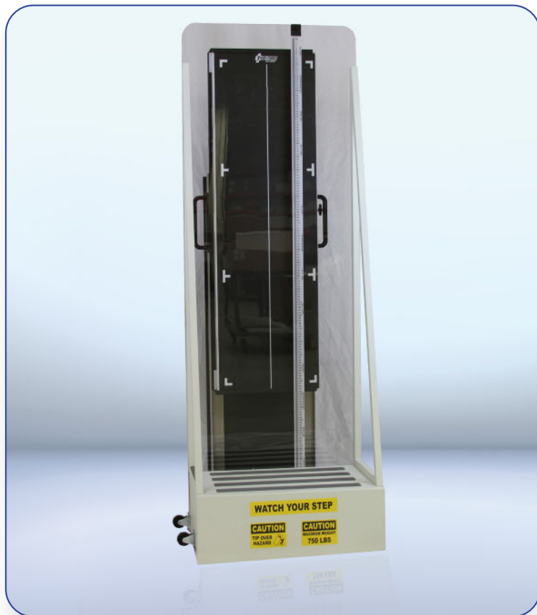
Attaches to Stitching Platform