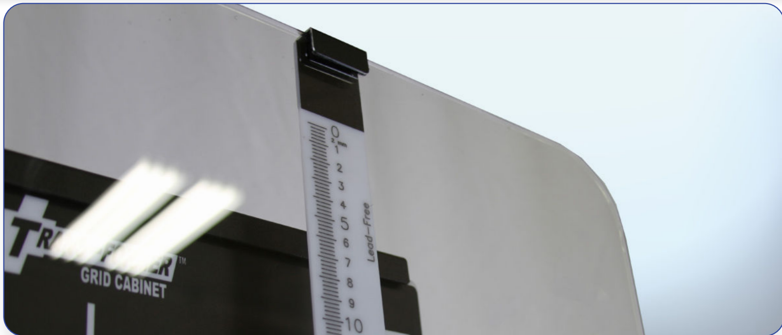
Hook allows for easy application, positioning and removal