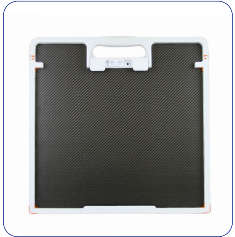
Rear Side with Twin-Lock™