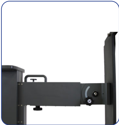
Telescoping arm and locks